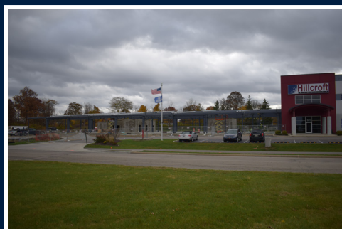
NOVEMBER 6TH 2018