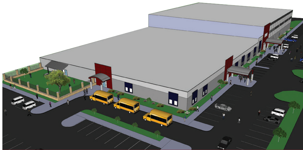
Future 45,000 square foot addition to the already existing 40,000 square foot building.

“The success of this campaign will be measured by a community appreciating and valuing those with disabilities for what they can do.” - Chris Cook