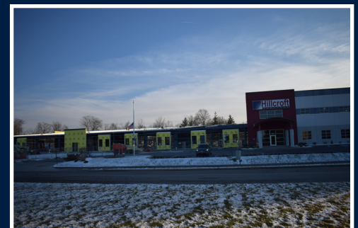
DECEMBER 7TH 2018