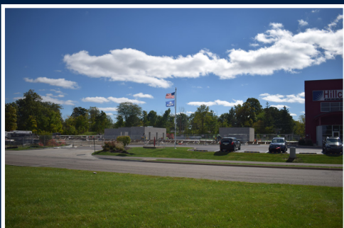
OCTOBER 11TH 2018