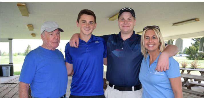
The team from TLC Management (Albany, Bethel Pointe, Parker)