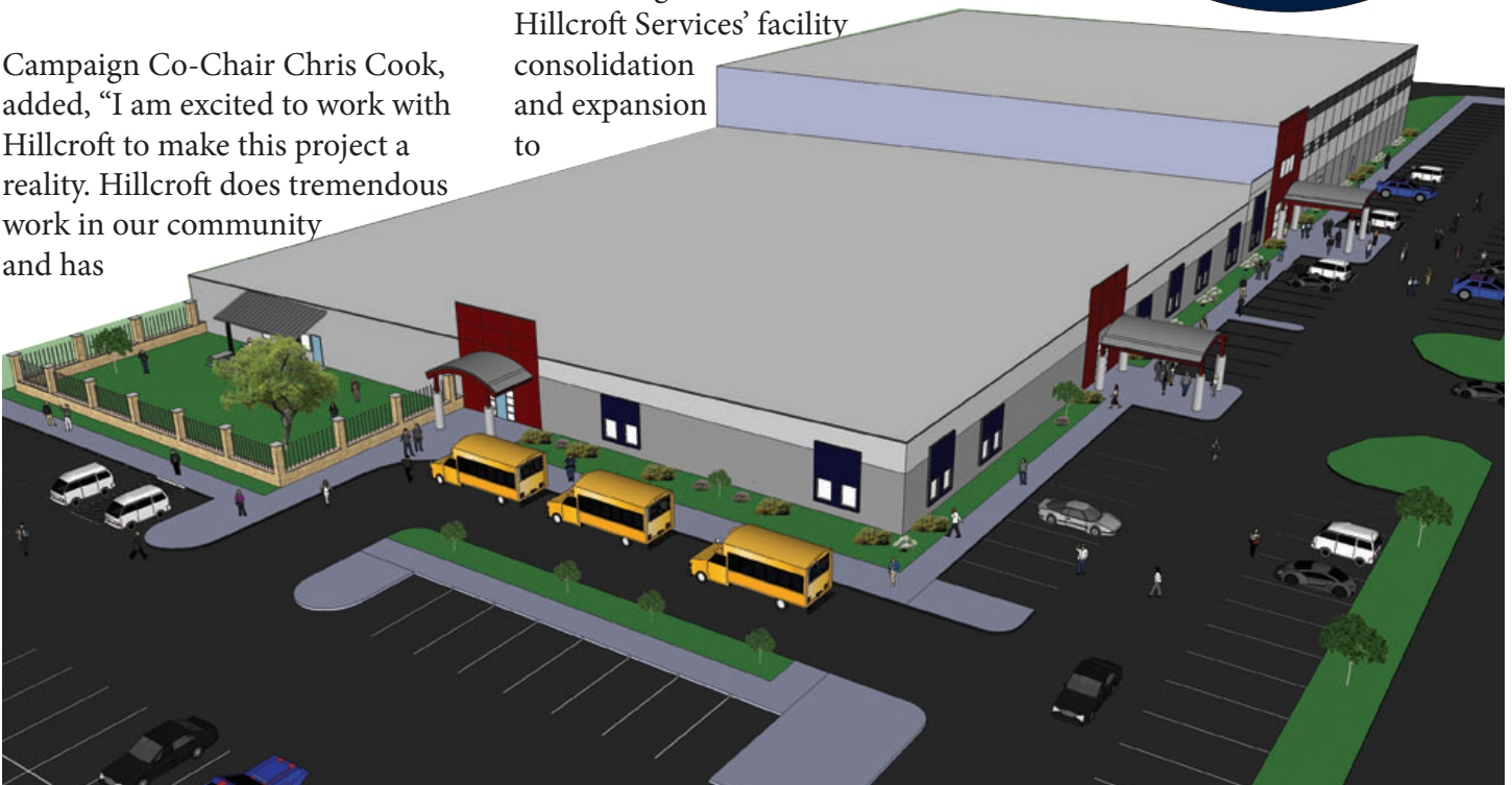
Future 45,000 square foot addition to the already existing 40,000 square foot building.