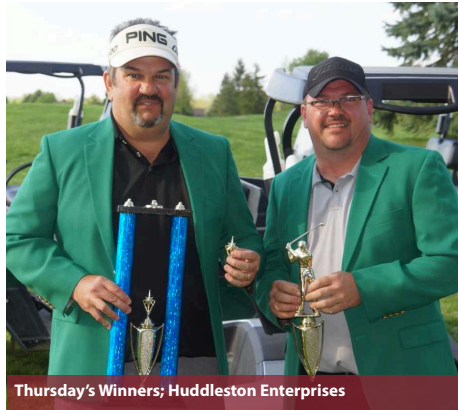
Thursday's Winners; Huddleston Enterprises

A GOLF OUTING FUNDRAISER FOR HILLCROFT SERVICES, INC.