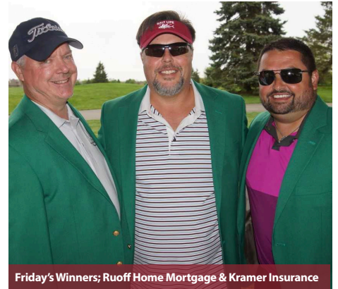
Friday's Winners; Ruoff Home Mortgage & Kramer Insurance